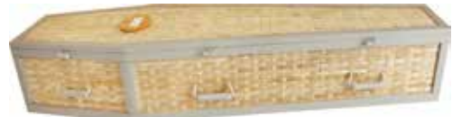
Premium Bamboo* £720