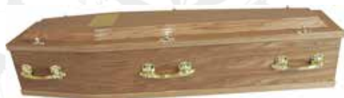
Worcester – Oak Veneer (also available in Mahogany) £595