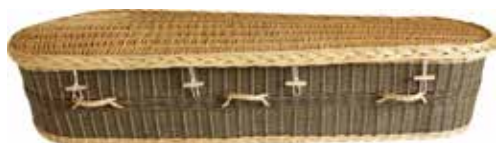
Personalised English Willow (Wicker) Hand-woven in Somerset, personalised to your specification £1,120