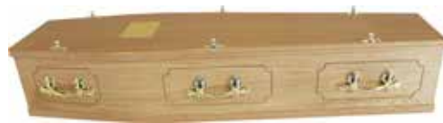
Rochester – Oak Veneer £520