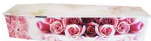
Reflections – Personalised Picture Coffins Choose from a ready-made design or design your own £920