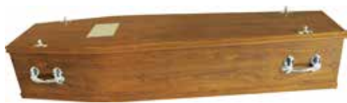
York – Oak Effect Foil Veneer £445