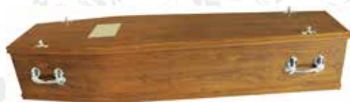
York – Oak Effect Foil Veneer £445