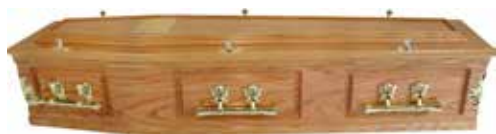
Surrey – Solid Oak (also available in Mahogany) £845