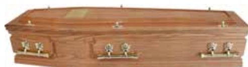
Westminster – Solid Oak (also available in Mahogany) £865