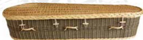
Personalised English Willow (Wicker) Hand-woven in Somerset, personalised to your specification £1,120