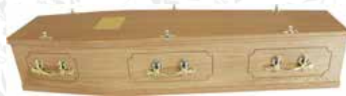
Rochester – Oak Veneer £520