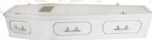
Oxford White – White Painted Veneer (also available in a range of colours - £720) £670