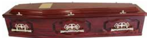
Windsor – Semi-Solid Mahogany (also available in Oak) £720