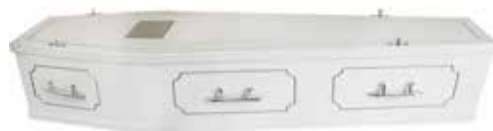
Oxford White – White Painted Veneer (also available in a range of colours - £720) £670