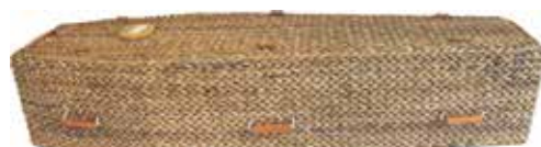
Banana Leaf – Coffin shape* (also available in Casket shape*) £995