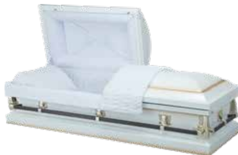
American-Style Caskets* American-style Caskets are available in wood or metal in a wide selection of designs From £1,470