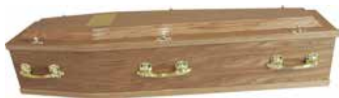
Worcester – Oak Veneer (also available in Mahogany) £595